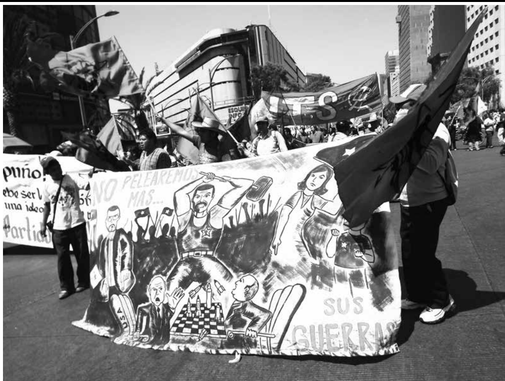
2014 May Day in Mexico

As it progressed, the international communist movement took up the struggle and organized May 1st celebrations every year. In the U.S., it was championed for many years by the old Communist Party, with 250,000 marching in New York City in the 1940s. But when that party abandoned any communist principles, May Day was resurrected by the Progressive Labor Party in 1971 which advanced more revolutionary ideas. May Day marches have been organized by the PLP for the past 44 years, in many cities — Washington, D.C., New York, Chicago, Los Angeles, San Francisco, Boston, Philadelphia,