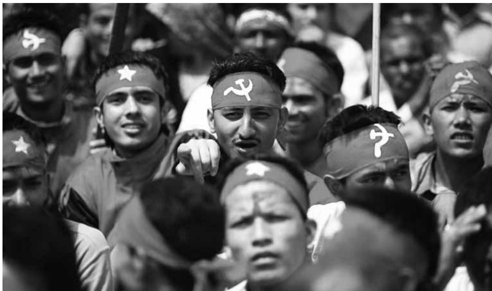
May Day celebrated after the first earthquake. Workers in Nepal need communism.

The article also drew attention to the crisis in Nepal's internal politics. Since the 2006 electoral victory of the fake "communist" Maoist movement, the coalition government has been squabbling over what type of federal system to in-