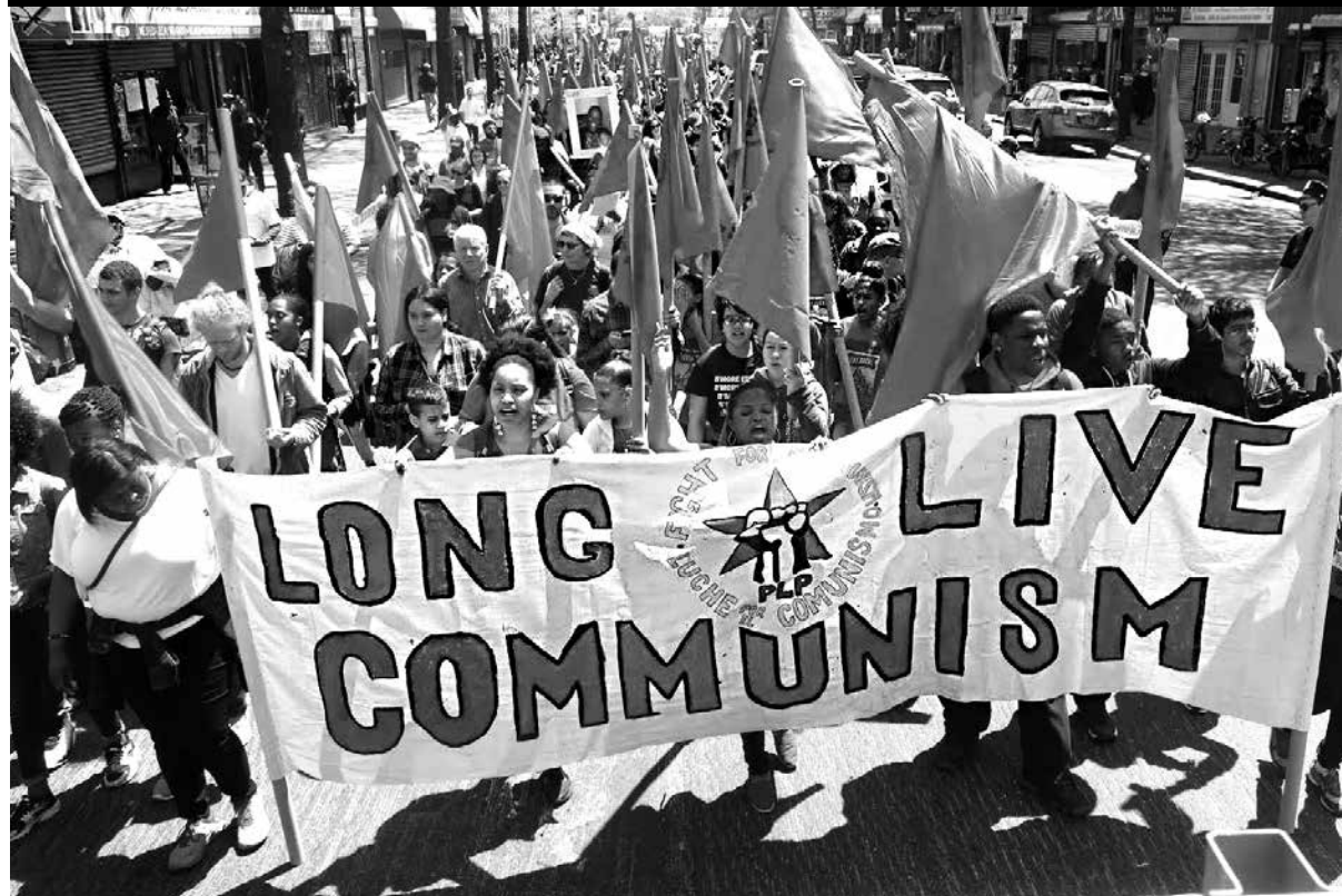
This is an excerpt of the main speech at PLP's May Day in NYC

Today, we celebrate the working class. Today, we celebrate our revolutionary force that can't stop and won't stop fighting back!