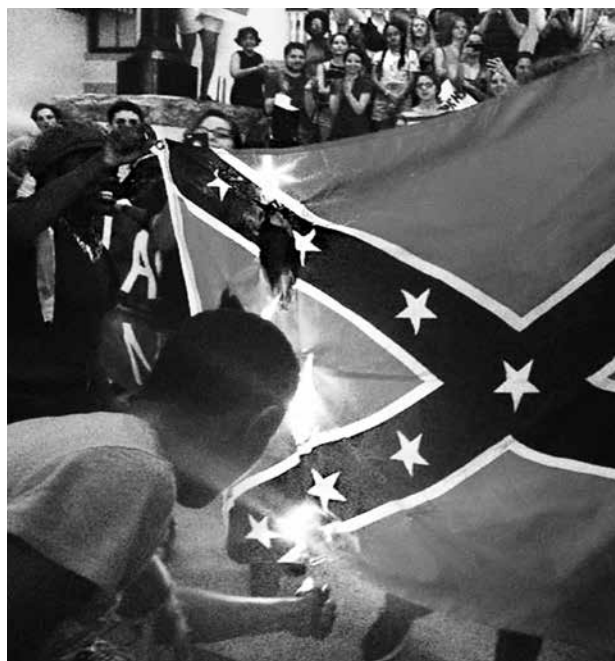
Confederate flag burning in Florida following racist vigilante murders at a Charleston church