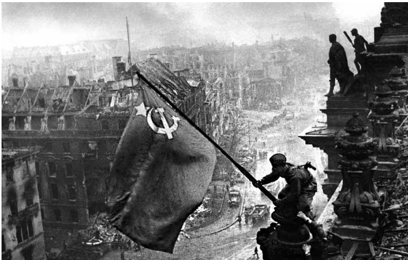
The Red Army plants the communist flag over Berlin's Reichstag building in 1945. Communists defeated fascists once and we are building a movement to defeat them once again.

It's important to expose these lies, though that never stops the anti-communists from spreading them and inventing others. Meanwhile, World War II is portrayed as "the Good War" in Western capitalist countries. A good book that un-