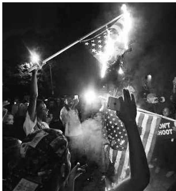
U.S. flag burning in Ferguson following racist police murder of Mike Brown