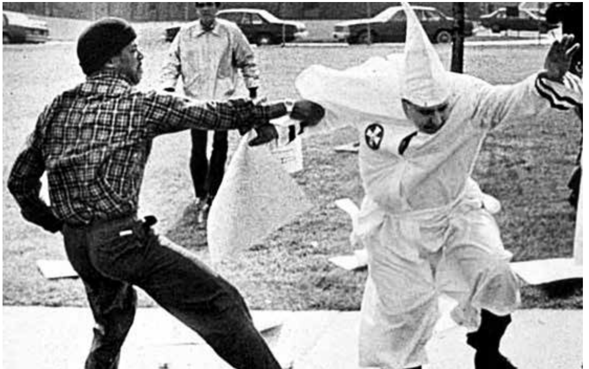
Racist klan member gets a beating at a KKK rally

Beginning in 1619, when the first Africans were brought in chains to Jamestown, Virginia, Black slaves in North America were beaten into submission. Public hangings were common. A large number were mur-