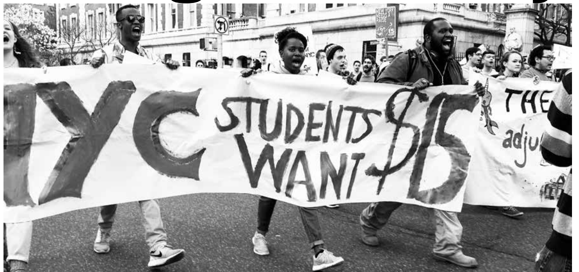
April 2015: College students take the streets in protest

Though FF15 is being lauded as a great victory, $15 an hour is only $600 a week before taxes, and not enough to pay the rent and buy groceries. In 1960, the nominal minimum hourly wage was $1, but that is equal to nearly $8 today, after inflation. In fact, the