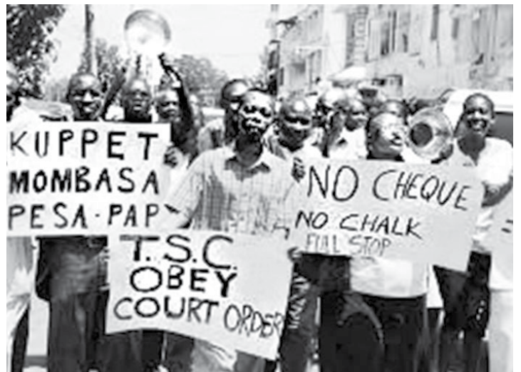
Kenya teachers on strike! One of the slogans was "No Cheque, No Chalk" (no paycheck, no teaching)

Students and teachers in Kenya are squarely facing the crises of global capitalism and U.S. imperialism. In September, at the same time as the teachers' strike in Seattle, public educators across Kenya waged a five-week strike against the national Teachers Service Commission (TSC). The strike was launched by the two national teachers' unions in response to the government's failure to follow through on promised pay increases of 50 to 60 percent, as ordered by Kenya's Supreme Court. According to the Nairobi-based Daily Nation, schools were "paralyzed" in most of the country as striking teachers "stormed" schools where teachers had scabbed (9/8/15). University students supported the strike, and the striking public school teachers built solidarity with non-unionized private school teachers.