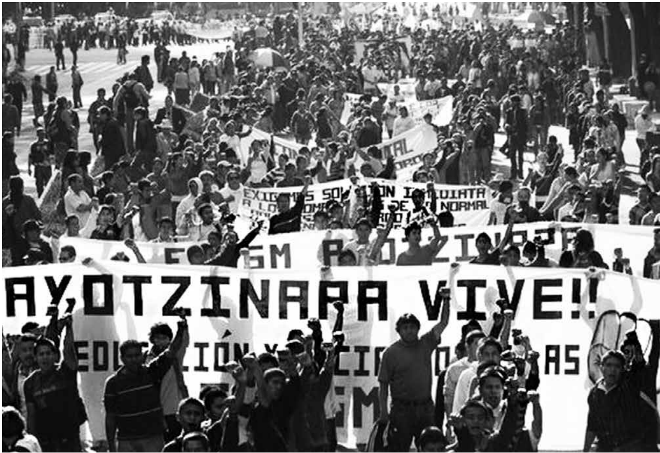
Ayotzinapa lives and the struggle continues

The main weapon the bosses in Mexico are using to contain working-class anger is liberalism. Liberal bosses are capitalists who pretend to be pro-working class. They are calling for citizens to participate within the framework of institutions based on capitalist ideology, like the National Commission on Human Rights (CNDH) or the Inter-American Commission on Human Rights (CIDH). As a result of being won to trust in these institutions, the working class organizes itself in a "well-behaved" way that doesn't fundamentally threaten capitalism. Liberal capitalist bosses and the institutions around them serve an important role in capitalism. They lead