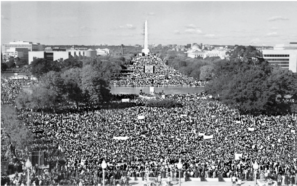
Masses of Black workers assemble against racism in Washington, DC and are greeted with bosses’ pacifism.

The crowd’s response to our literature reflects the conclusion being drawn by workers across the world: The whole rotten system needs to go. Progressive Labor Party says YES, capitalism must