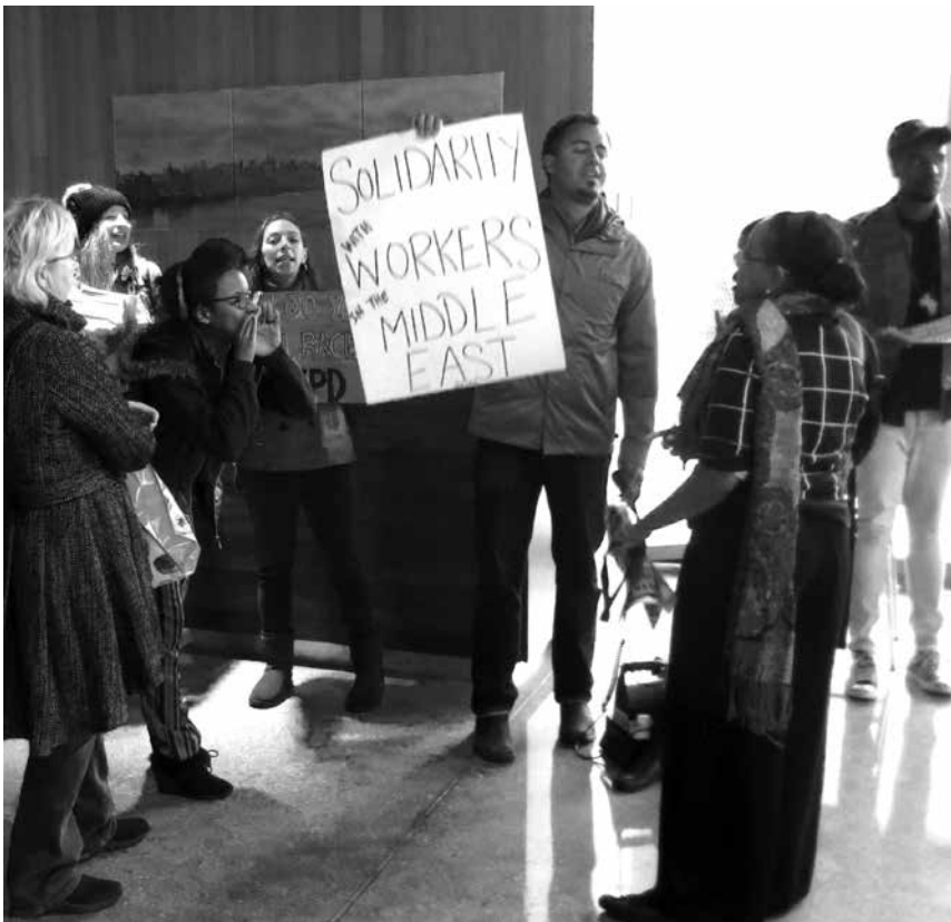
Inside MEC: “When they say exit — we say fight back!”

NEW YORK, November 12 — This Veteran’s Day, twenty members and friends of Progressive Labor Party rallied against racist tuition hikes at Medgar Evers College (MEC), a Brooklyn branch of the City University of New York (CUNY). As we confronted campus cops and attacked racist police terror, we explained how imperialism is leading to world war. Most important, we raised the banner of communist revolution.