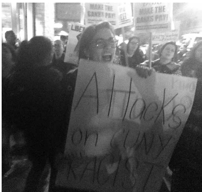
Bringing anti-racist rage to the student march at Hunter College