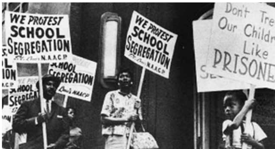
campaign to desegregate schools in 1960s

If you look at all the...auxiliary organizations[of the Communist Party in Alabama], the International Labor Defense,