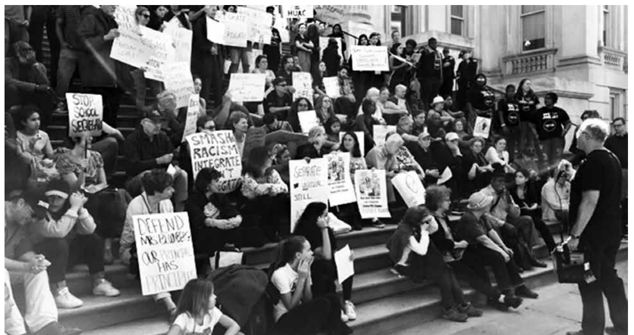
NYC, May 31—Park Slope Collegiate parents organize a vigorous multiracial rally in front of DoE headquarters.

New York City school students suffer the racist indignity of attending one of the most segregated school systems in the country. This is no accident. It is a calculated plan by the city's ruling class to maintain exclusive enclave schools that are significantly or predominantly white—and to subject the other 90 percent of the city's 1.1 million public school children to a racist, sub-par education.