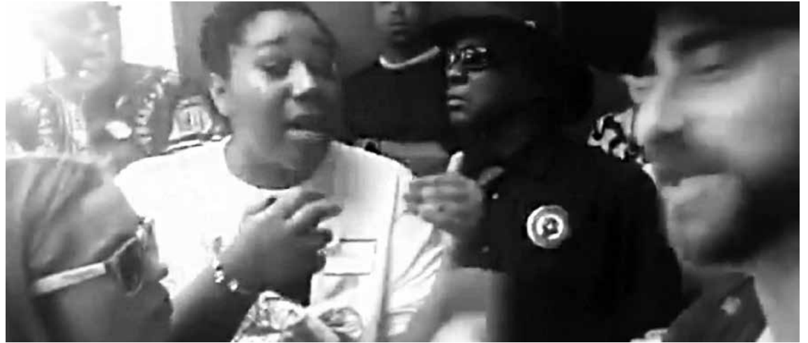
Members of CRJ push back against racists disrupters

Trump's presidency has emboldened the racists and is creating a base for a mass racist move-