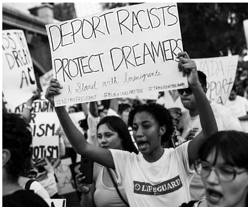
LAS VEGAS, Sept 10—Hundreds march in response to Trump's DACA decision.

We don't get to choose our choices under capitalism. For the millions undocumented and refugees families across the world, there is one