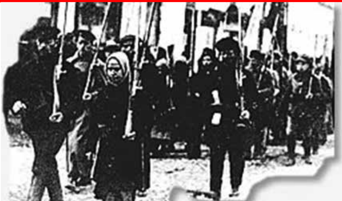
Bolshevik volunteers, 1917

At the same time, a multiracial party women and men communists organizing across the vast Russian Empire, nicknamed "Bolsheviks," solved the question of legality a different way: by organizing for illegality. Dur-