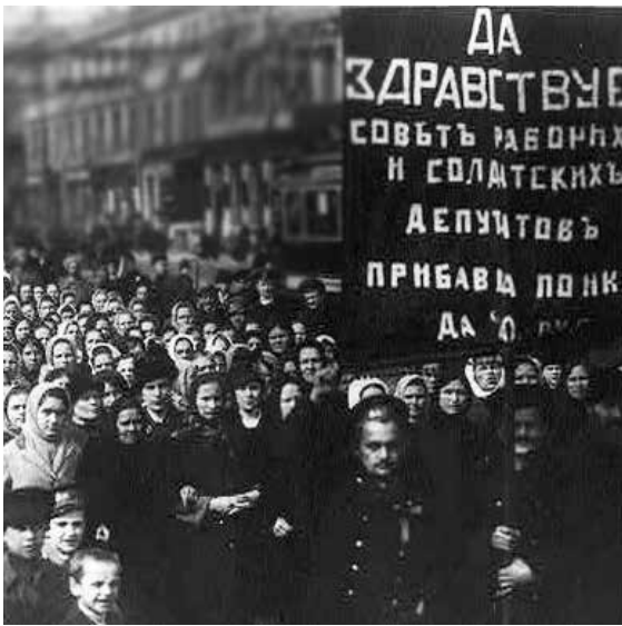
Banner reads, “Long live the Council of Workers ‘and Soldiers’ Deputies”

This is the part of an extensive series about the Bolshevik Revolution and the triumphs, as well as the defeats, of the world communist movement of the 20th century. We welcome your comments and criticisms, and encourage all readers to discuss this period of history with their friends, classmates, co-workers, family, and comrades. The following illustrates the Bolsheviks’ armed uprising in Petrograd on October 27 / November 7, 1917. It is often called “the Russian Revolution.” In fact, uprisings took place in a great many cities and towns.