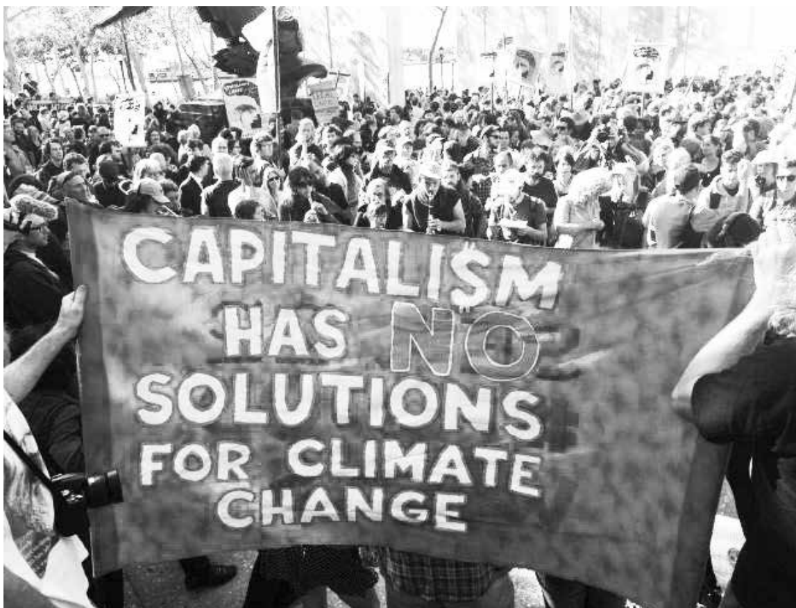
A mass climate change march in New York City

particulate to the air, causing more health problems.