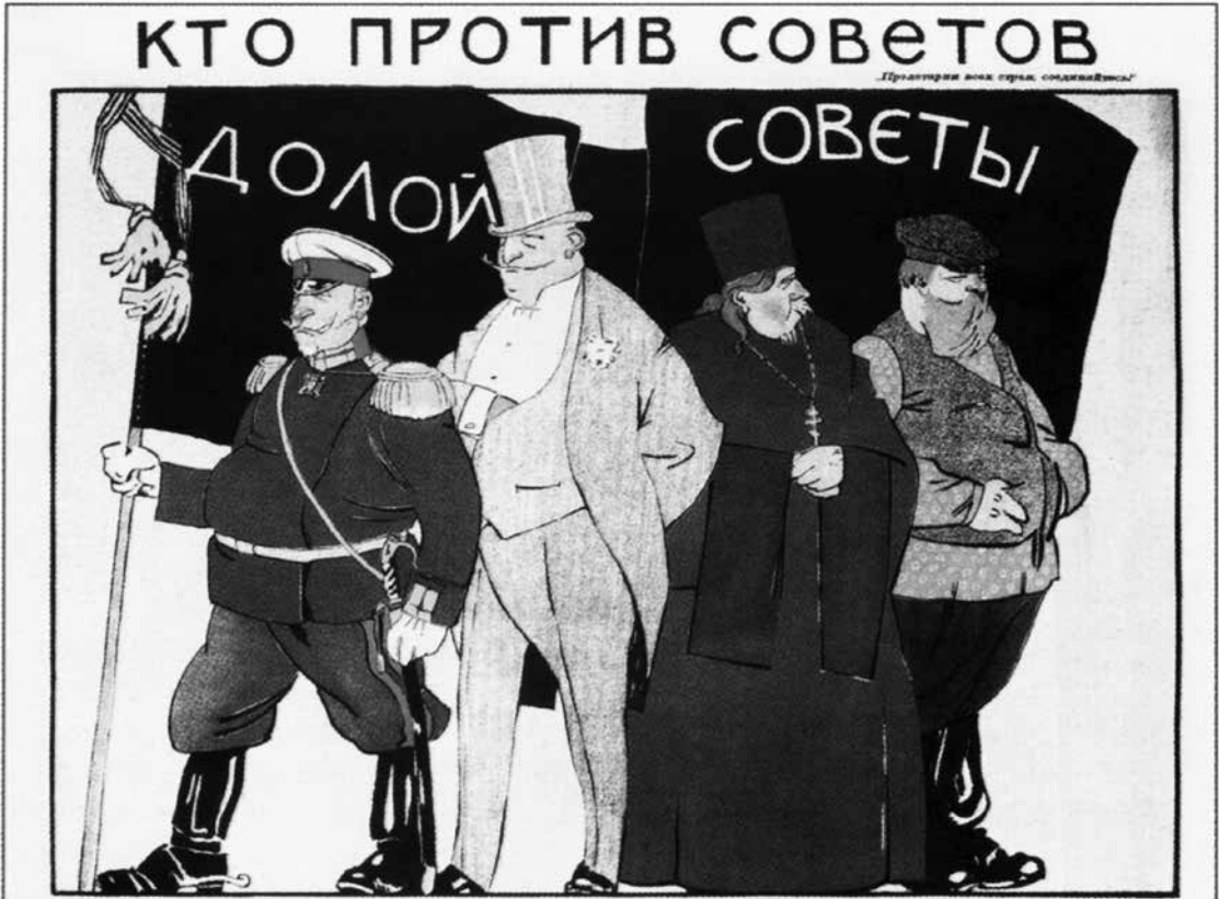
1919 Soviet Poster

Caption reads: who is against the Soviet Union?