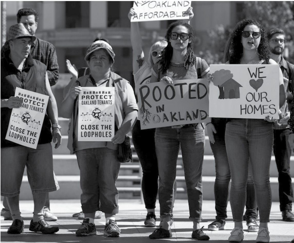
Tenants rally at Frank Ogawa Plaza in front of City Hall in Oakland. They are protesting a legal loophole that is leading to rising rents and evictions.

The workers responded with collective actions and are involved in a local non-profit to plan the fightback. This organization’s direct actions recently succeeded in preventing foreclosures, evictions and rent increases for several working class families. Tactics varied from direct action picketing, to email/calling blasts, and coverage in local liberal media. There are Oakland and