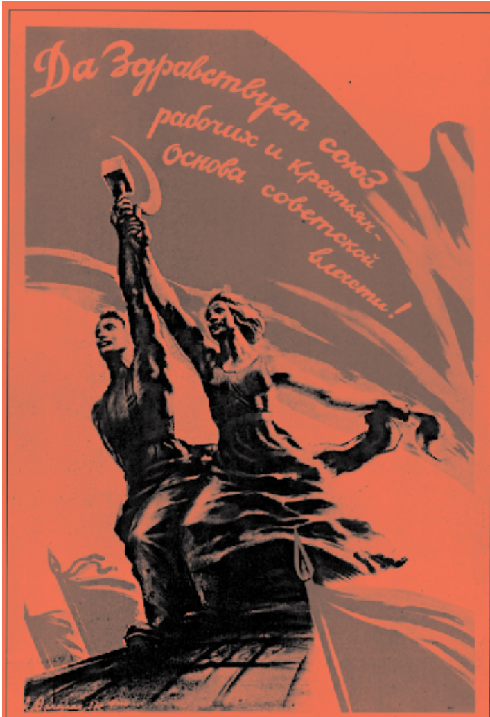
1930s Soviet poster reads, “Long live the Union of the workers and peasants—the basis of the Soviet power”

This is the part of an extensive series about the Bolshevik Revolution and the triumphs, as well as the defeats, of the world communist movement of the 20th century. We welcome your comments and criticisms, and encourage all readers to discuss this period of history with their friends, classmates, co-workers, family, and comrades.