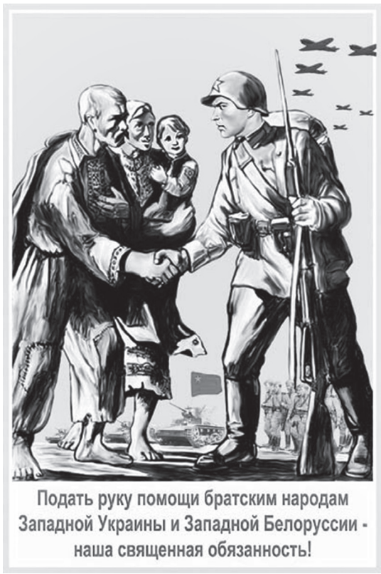
Poster reads, “Lend a helping hand to the fraternal people of Western Ukraine and Western Belarus—our sacred duty!”

This is part of an extensive series about the Bolshevik Revolution and the triumphs, as well as the defeats, of the world communist movement of the 20th century. We welcome your comments and criticisms, and encourage all readers to discuss this period of history with their friends, classmates, co-workers, family, and comrades.