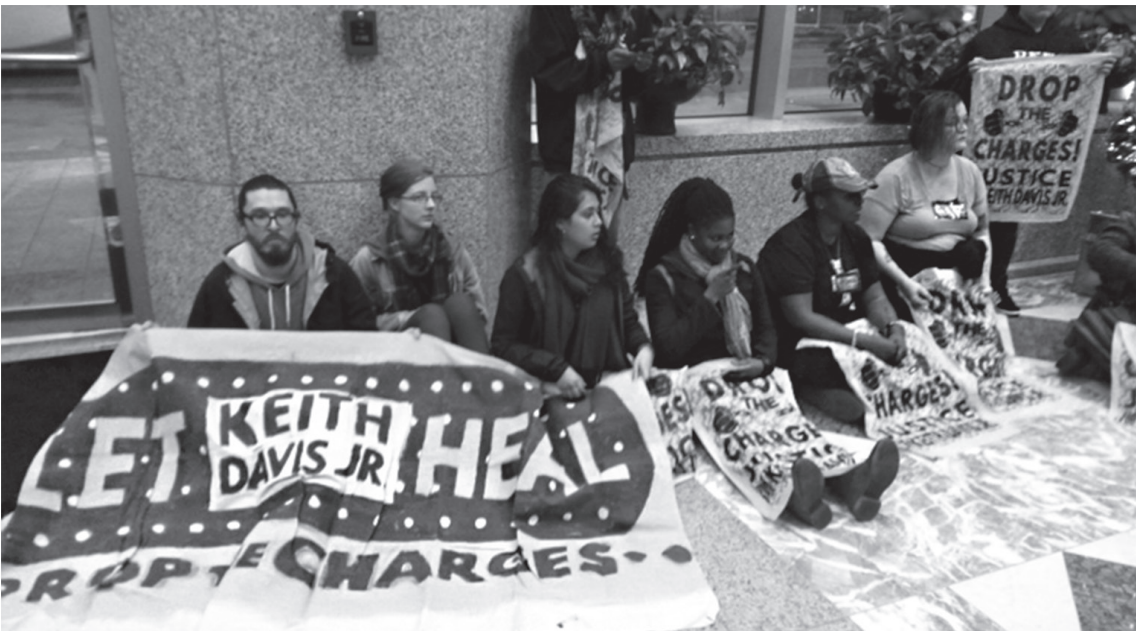
Multiracial protest inside the State Attorney’s office.

This case exposes the role of this capitalist state that will go above and beyond to frame, convict, and lock up Black and Latin workers. The police, the courts, and politicians all work together to preserve this racist system. The criminal injustice system originates from slave patrols and slave laws. The modern capitalist legal system is born out of the law enforcement system that existed for the purpose of controlling the slave population and protecting the interests of slave owners.