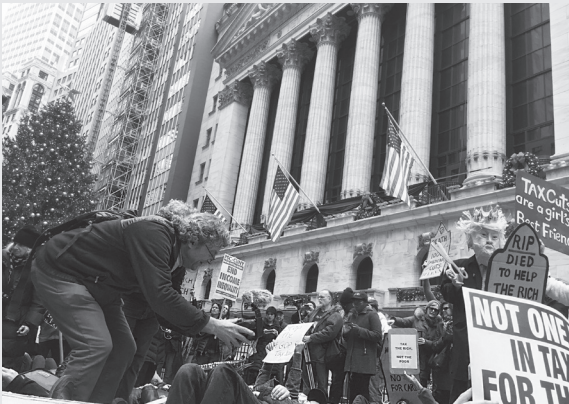
Media takes photos of us laying down. The PSC leadership does not have our backs. They literally want us on our backs.

I was at the PSC rally, and participated in my very first "die-in" with a coworker and friend. I've participated in PLP-led projects during the Ferguson and Baltimore rebellions, and still I felt safer then among my comrades and friends than during this die-in. A die-in is a tactic used by liberal pacifist and nonviolent groups, where a mass of people simply lie down in the street and block traffic. The PSC leaders thought this would be a great idea to try out in front of the Stock Exchange, and about 60 of us did it. Physically lying down and voluntarily surrendering your body to whoever or whatever's coming at you was the most uncomfortable part.