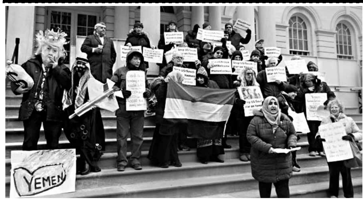
NYC, March 20—Fifty antiracists protest Saudi Prince visit and U.S. war in Yemen (see page 4)

We encourage all CHALLENGE readers to send in letters and articles about their experiences fighting the bosses worldwide.