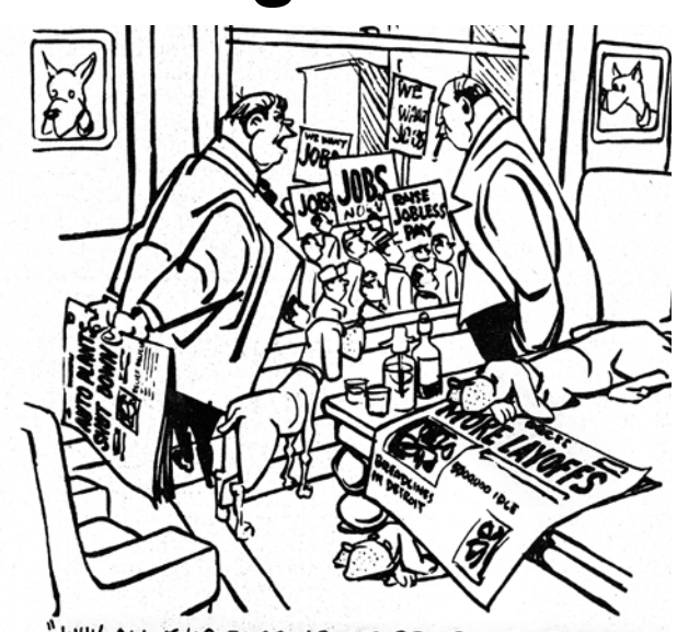
WHY ALL THIS FUSS ABOUT BEING UNEMPLOYED .. I HAVEN'T WORKED A DAY IN THE LAST 20 YEARS ! "

The bosses' economists declare that a 5 percent unemployment rate means "full employment." But obviously the working class is suffering vast unemployment. The latter is especially true for Black workers whose joblessness because of racist discrimination is at least double that of white work-