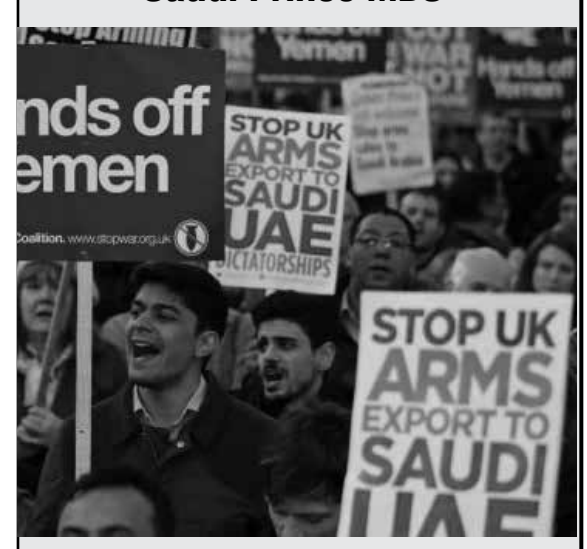
Anti-war protests against fascist Saudi Prince Mohammed bin Salman in UK

Protesters Decry war criminal Saudi Prince MBS