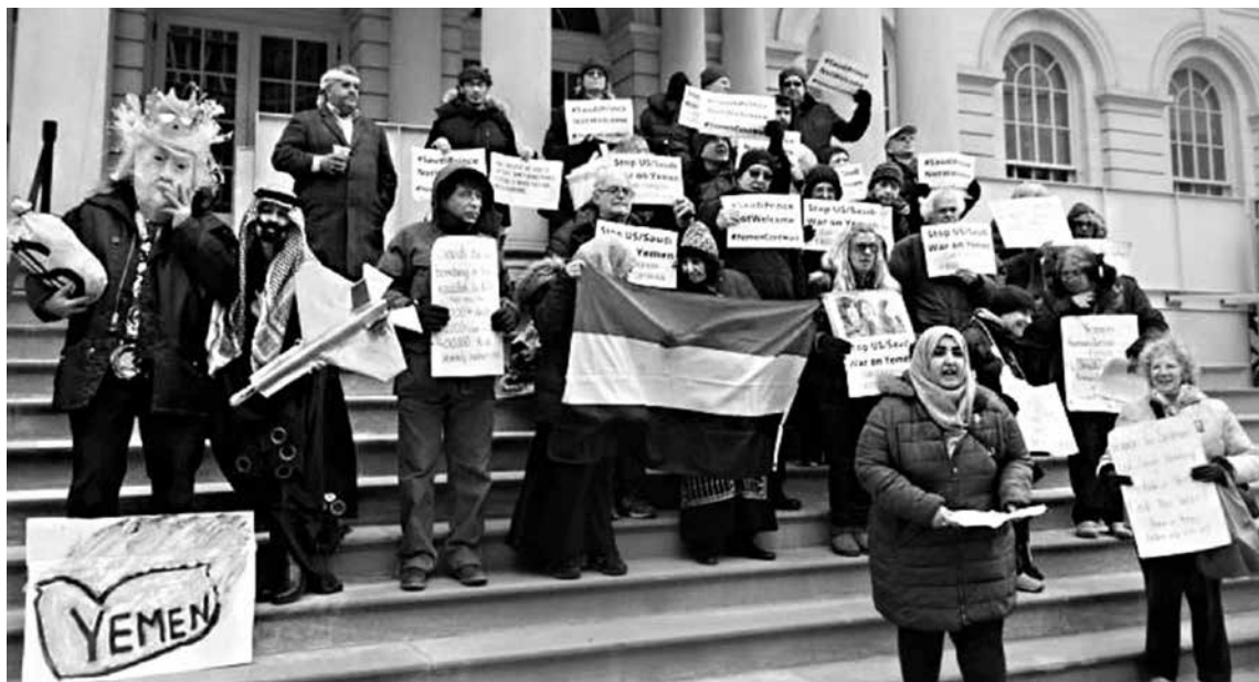
NYC, March 20—Fifty antiracists protest Saudi Prince visit and U.S. war in Yemen (see page 4)

We encourage all CHALLENGE readers to send in letters and articles about their experiences fighting the bosses worldwide.