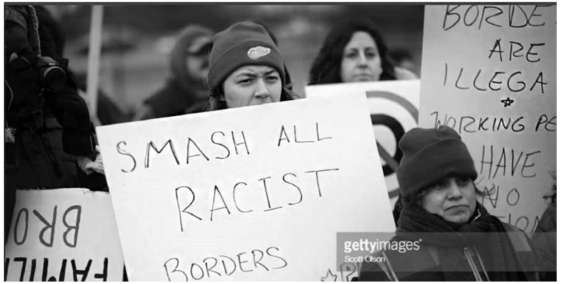
Protest against deportations at Gary-Chicago Airport on February 23

INDIANA, April 28 —Members of the Progressive Labor Party in Indiana have been connecting with community members through collective fight back against deportations, arrests, and racist police murders.