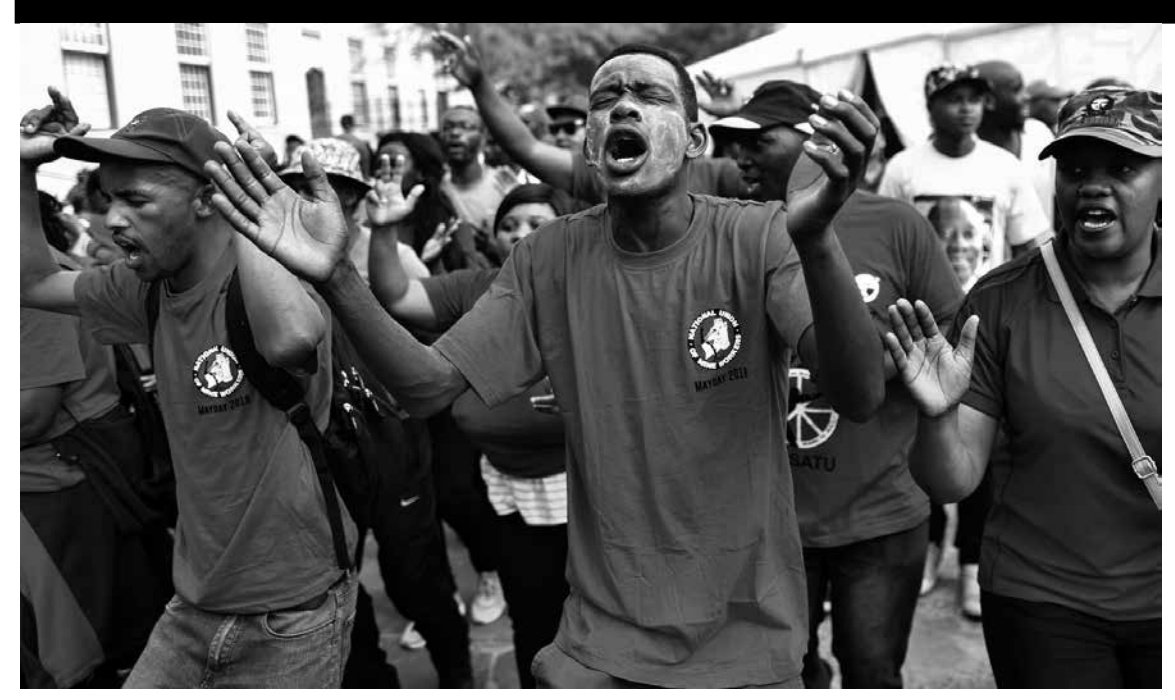
MAY DAY IN SOUTH AFRICA—Workers campaign around a national minimum wage and miserable working conditions.