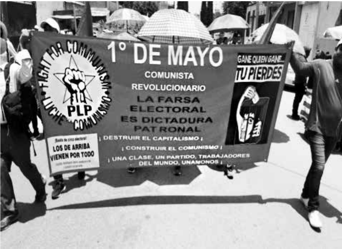
Main text of banner reads, A Revolutionary Communist May Day THE ELECTORAL CHARADE IS A BOSSES DICTATORSHIP Destroy Capitalism Build Communism ONE CLASS, ONE PARTY, WORKERS OF THE WORLD UNITE

On the other hand, we are pushing for class struggle, spreading our political line and getting more members who want a revolutionary communist change.☛