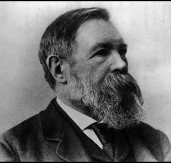
Two of our earliest leaders of the communist movement—the collective of Karl Marx and Friedrich Engels

torship is but the transition to the abolition of all classes and to the creation of a society of free and equal.