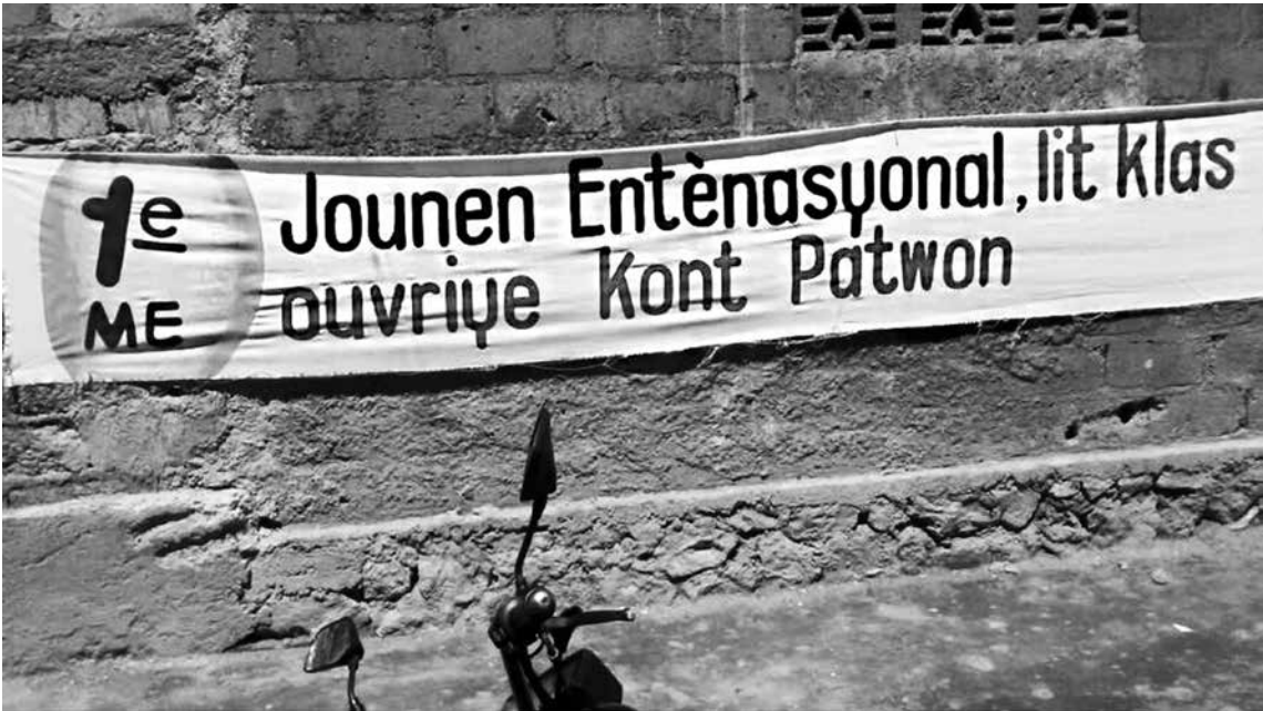
Banner reads, May 1: international day of struggle of working class against bosses

The bosses' festival provoked a discussion among our friends and comrades about what is the underlying politics of workers' struggles. It was communist leader Vladimir Lenin who said that