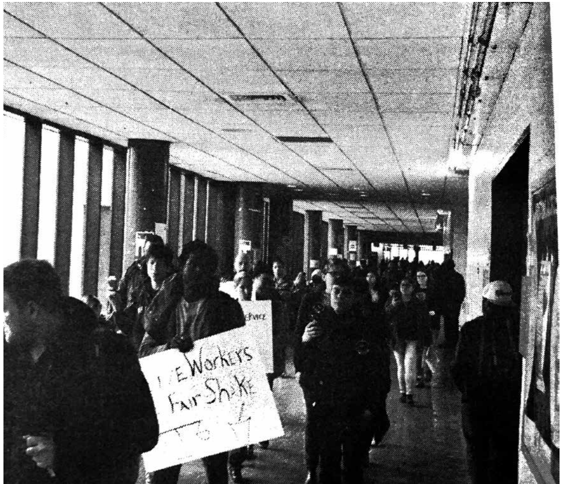
KCC students, staff and workers marched on and confronted the KCC President’s chief of staff to support the cafeteria workers (see CHALLENGE, 4/18).

Thanks to regular distributions of CHALLENGE outside of the campus gates and PLP support of local struggles, this May Day also saw recruitment and new friendships among the students to PLP. Through study groups on topics like reform and revolution, PL’s student work began sharpening at the time that some students became interested in