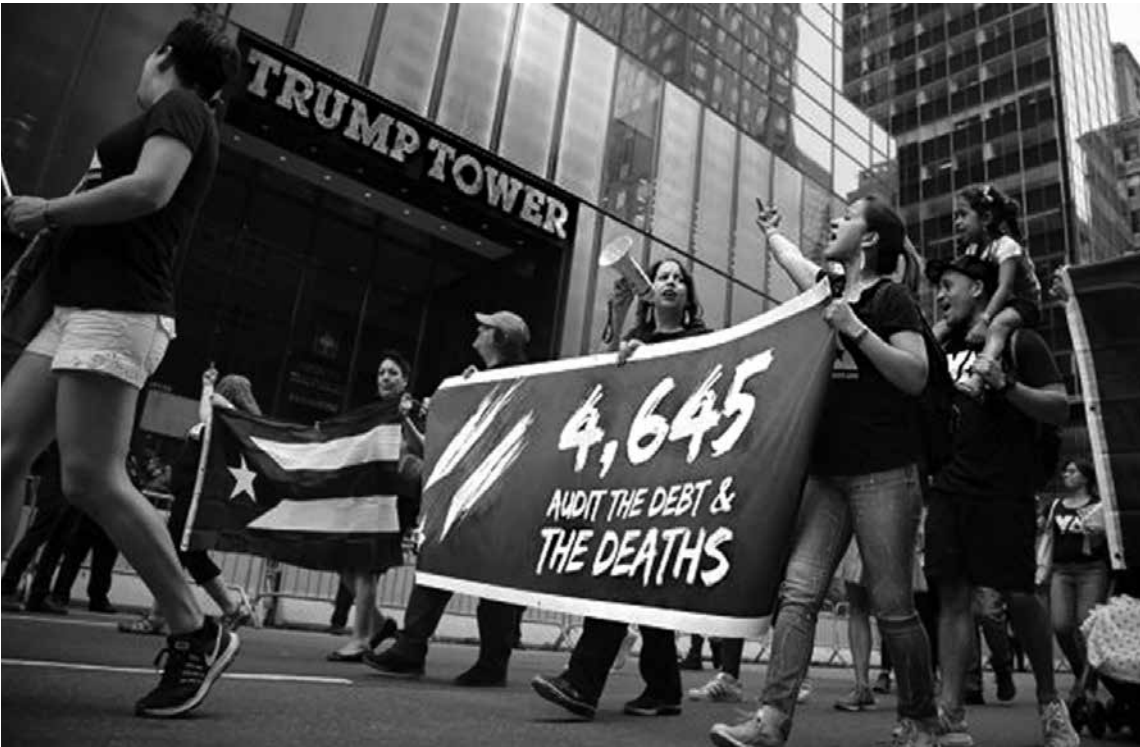
This year's Puerto Rican Day parade in NYC

Many people still don't have electricity or water. Batteries are being stolen out of generators. People are tired and vulnerable—and the ruling class is taking advantage of this disaster to advance a corporate reform agenda. For all the public sector workers in our country, including in education, organizing now is very hard. The Secretary of Education tried to shut down more schools after the hurricane, but