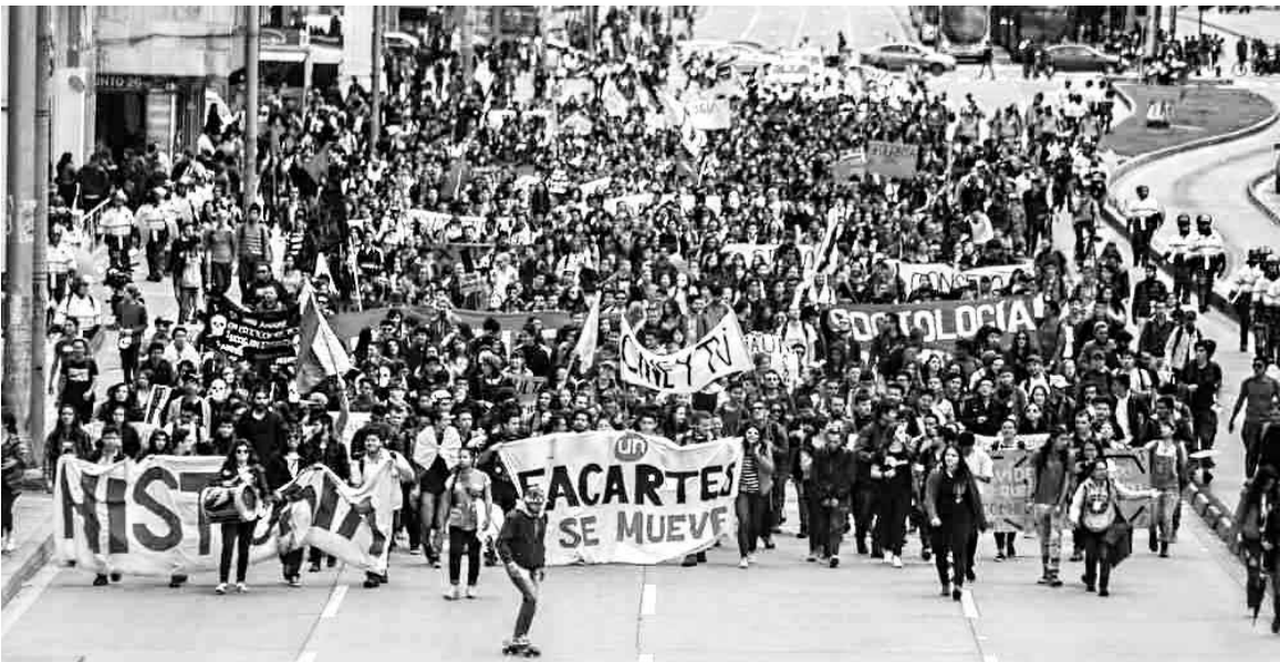
Thousands of students across the country will be on strike on October 10 against capitalist crisis of public universities. Student condemn President Ivan Duque whose new budget has more money for war but not for education. Such is the nature of capitalism.

This reactionary pol was elected in the last election with 10,365,000 votes won using a nationalist campaign of slander, threats, falsehoods, corruption and vote buying misinformation with anti-communist warmongering propaganda, driven by the media RCN and Caracol. This was noticed in the consciousness of many proletarians who, with their political and ideological ignorance, end up supporting their class enemies. Gustavo Petro pacifist candidate of Social Democracy, got 8,029,000 votes, appeared to be a good potential for supporters who want to change their lives and are tired of paramilitary terrorism and the right-wing dictatorship. Unfortunately they believe in the bosses' electoral promises that sound good in theory, but in practice are set against our needs