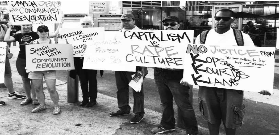
Protest against sexist culture of capitalism

The appointment of the sexist liar Brett Kavanaugh to the United States Supreme Court exposes the true nature of a “representative democracy”, a system where workers are excluded from any influence in decision-making. President Trump, who lost the popular vote by over 2 million people, chose the nominee. It was reviewed by the Senate, which has two members from each state regardless of the size of the state. The Supreme Court contains 9 members appointed for life who are the final decision makers for the entire judicial branch. Compare the grip of this tiny number of people over the lives of 300 million workers in the U.S. with the vast opportunity for all workers under communism.