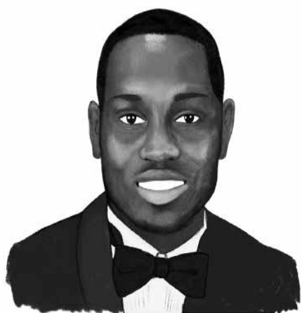
AHMAUD ARBERY May 8, 1994 – February 23, 2020