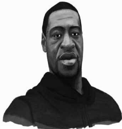
GEORGE FLOYD #JUSTICEFORFLOYD