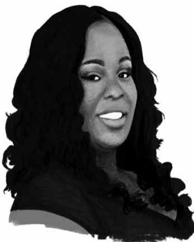
BREONNA TAYLOR June 5, 1993 – March 13, 2020