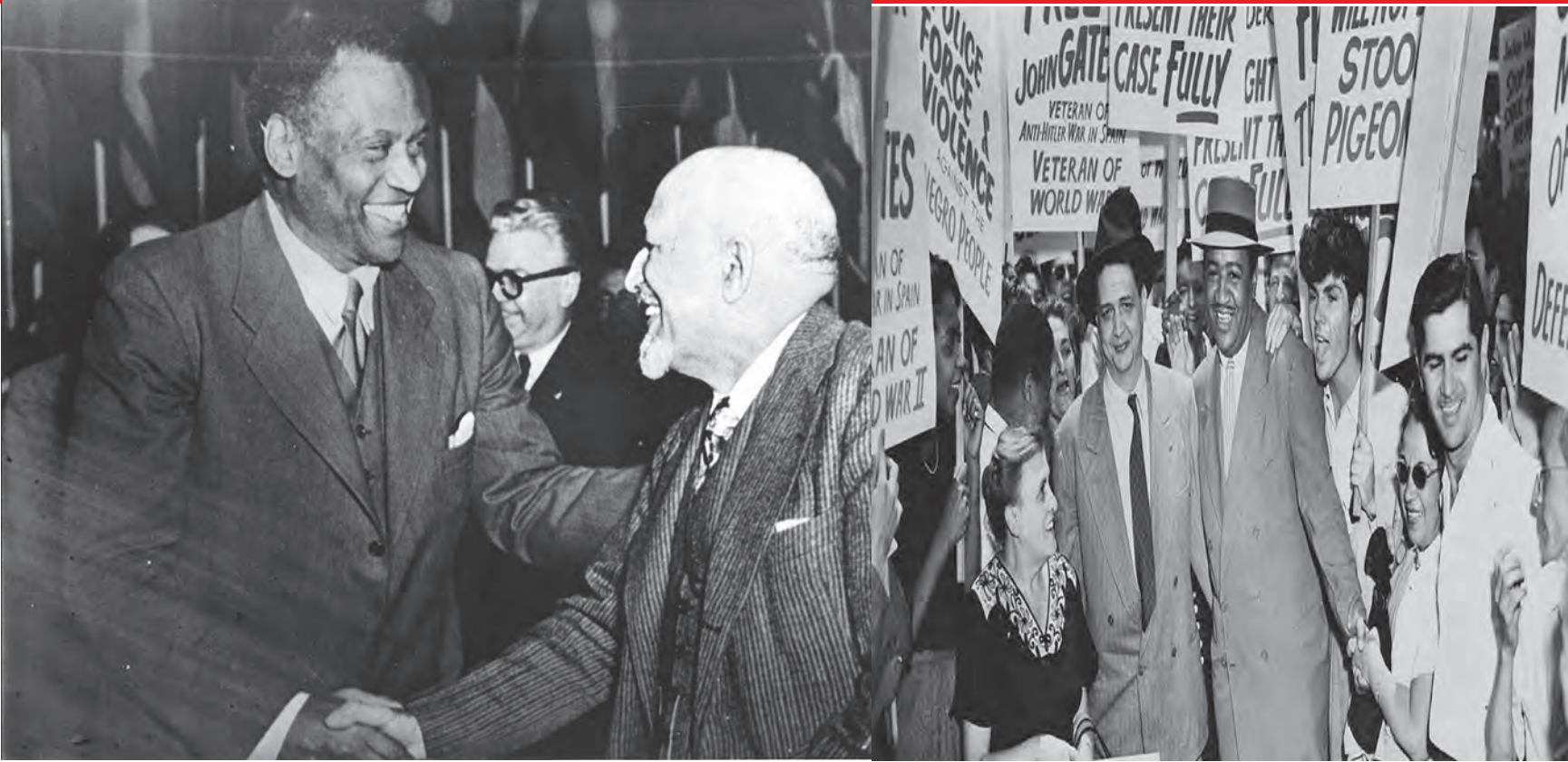
Robeson, Dubois, pictured right shaking hands and Davis pictured left, comrades in antiracist struggle

The principled stance taken by three of the greatest Black communist leaders of the 20th century — Paul Robeson, Benjamin Davis and William E. B. Du Bois, showed through their practice that to fight racism you have to fight the bosses. They understood that racism was created by capitalism to both divide and weaken the working class as well as to net the bosses hundreds of billions in super-profits from the lower pay forced on Black and Latin workers.