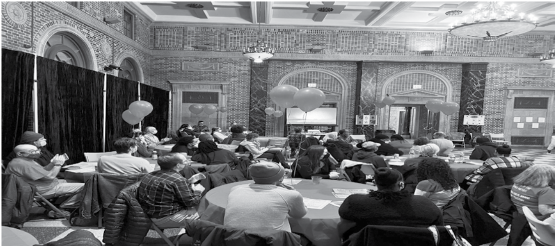
Workers and PLP gather to learn from October Revolution.

CHICAGO, November 19 —Over 50 multiracial workers and youth gathered in a local fieldhouse for our annual October Revolution celebration, marking the monumental seizure of power by the working class over a century ago. For years, our collective has held a social event in which we honor the communist Bolshevik Party and the millions of workers and soldiers who overthrew the capitalist bosses across the former Russian empire. This year’s theme was “Commit to the Working Class.” In this temporary period of low class consciousness and struggle, rotten capitalist ideas such as nationalism, racism, and individualism still hold sway. Communists need to be at the forefront of winning workers internationally to commit to our class interests and to build Progressive Labor Party (PLP) as the only way to win a communist world without capitalism’s violence and exploitation. In 1905, the Bolsheviks took heavy losses after a revolutionary uprising gave way to widespread oppression from the bosses’ state. Yet, by maintaining their resolve and rebuilding their forces, were in a position to lead the workers to take power in a massive country twelve years later in 1917. Even when our working-class forces are small, the decisions and actions that we make today