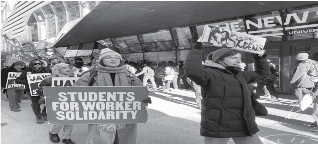
Workers and Students rally for better pay for teachers.

NEW YORK CITY, November 23 —Since November 14, the union for the Part-Time Faculty (PTF) representing 2,600 teachers ( 87 percent of the entire faculty of the New School) has been on strike because the administration refused to meet their simple reasonable demands for higher wages and better benefits. Many full-time faculty and students quickly joined the PTFs, canceling classes and issuing statements opposing crossing picket lines (physical and digital).”Progressive Labor Party (PLP) members are joining these striking workers, bringing a strategic revolutionary message of the need to struggle for communism. The City University of New York’s (CUNY’s) 30,000-strong Professional Staff Congress (PSC)