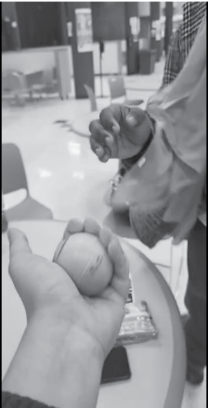
Exhibit A: the dangerous "public safety threat," a foam ball.

Despite these attacks —or because of them— the antiracist club Common Ground has seen over 100 students express interest. Leadership of a core of militant, Black, Asian and immigrant women and men leadership is emerging. This growth under sharpening external attack has sharpened internal debates, and members and friends of the Progressive Labor Party (PLP) have encouraged making time for addressing important questions. Rich ex-