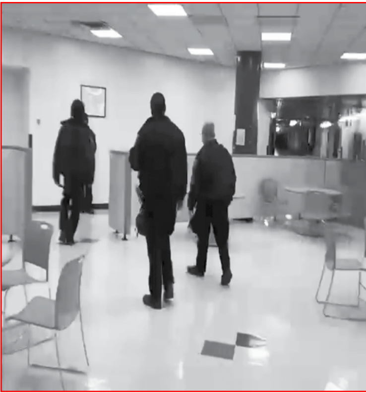
Exhibit B: students resist racist "ID check" and force campus police to retreat.

changes that began over tactics and strategy have widened into debates over reform versus revolution, with the ultimate question of confidence in the international working class at the heart of it all.