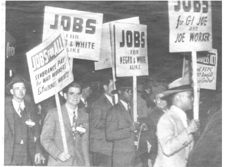
Washington, D.C., Sept. 1945 — Black and white workers march united for jobs after the end of WW2.

The bosses’ media say the Madoffs, the sub-