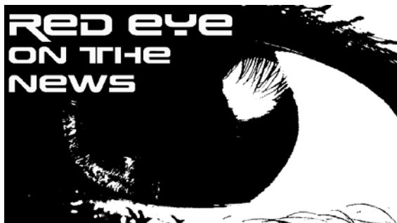
Below are excerpts from mainstream newspapers that may be of use for our readers. Abbreviations: NYT=New York Times, GW=Guardian Weekly, LAT=Los Angeles Times