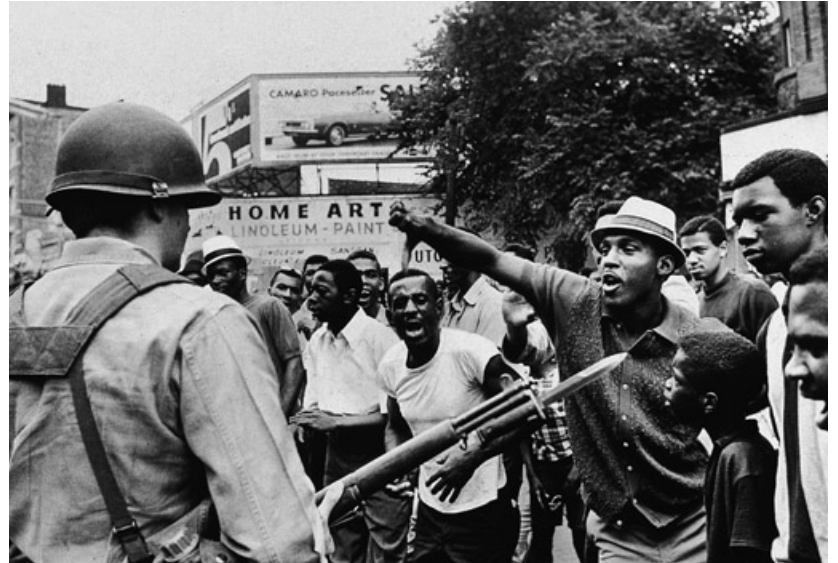
1967 Rebellion in Newark, New Jersey

This militancy wasn't only, or even mainly, inside the organized movement. In 1965, police harassment of a black man sparked an anti-racist rebellion in Watts, California. King went to Watts and supported the armed cops and National Guard troops, while urging rebels to be peaceful. When his pacifism was rejected, King phoned President Lyndon Johnson (who had sent him to Watts) complaining about "all of these tones of violence from people out there in the Watts" (New York Times, 05/14/02). King's last campaign to support 1,200 striking sanitation workers in Memphis, Tennessee in the spring of 1968 is supposedly his most radical. But King fled the March 28th protest when a group of demonstrators, frustrated with pacifist leadership, smashed