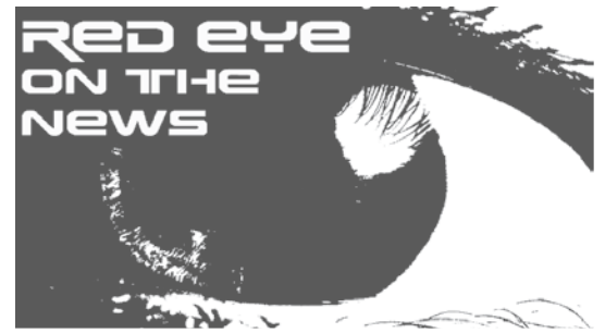
Below are excerpts from mainstream newspapers that may be wordpress.com. Abbreviations: NYT=New York Times. GW=Guardian Weekly, LAT=Los Angeles Times

Workers and their allies in all of South Asia must break with all these bosses, their imperialist backers and all the Muslim and Hindu fundamentalists, and build a revolutionary communist leadership as the only way out of this hell. O