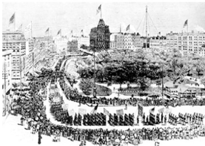
First U.S. Labor Day March, New York, 1882

The first half of the 20th century saw militant May Days, most led by communists, drawing tens of millions around the world. In 1947, the U.S. Communist Party (CP) organized 250,000 to march in New York City. But soon the CP sold out its prin-