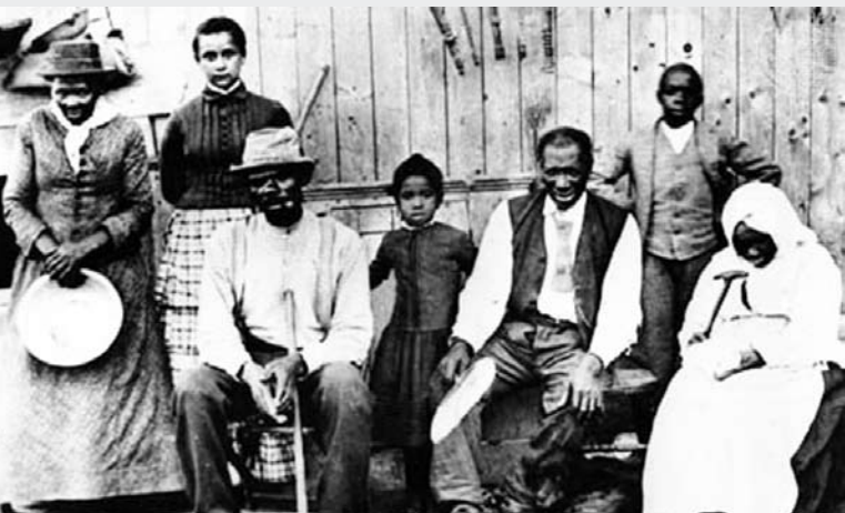
Harriet Tubman (far right) with freed slaves

Today's supporters of anti-racist struggle understand — just as did the thousands backing Brown and Tubman 150 years ago — that revolutionaries like the raiders then and PLP now are the honest, reliable leaders in struggle. When direct action is required, they know to whom to turn. CHALLENGE constantly reports workers being won to militancy and multi-racial unity in struggles against the racist bosses, hailing those joining our ranks. Step by step, the communist movement will grow and lead the working class to revolution and a new world based on members of our class mutually meeting each other's needs, without racist bosses and their profit system. ☸