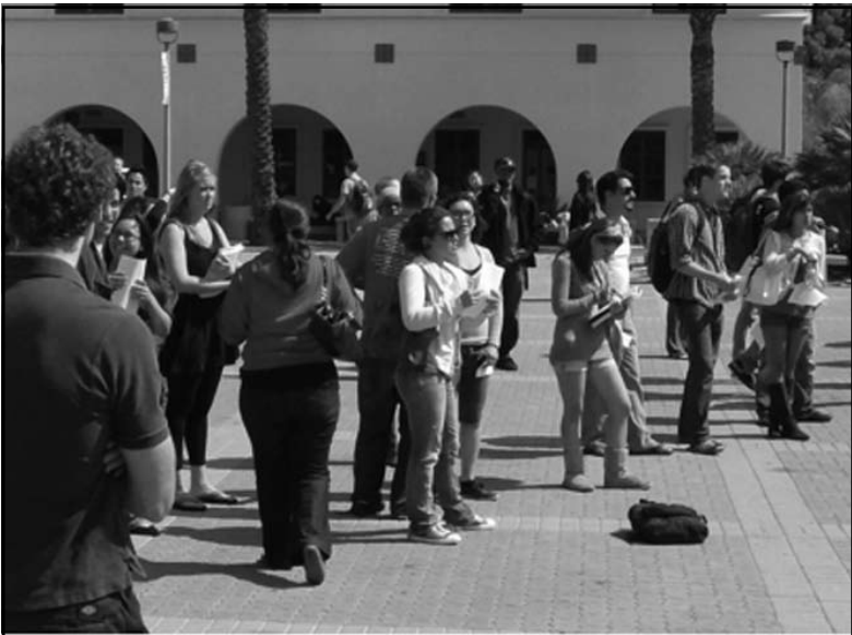
Students Listen to Rally Speeches

Another speaker explained that the current economic crisis "provides us with a clear view of the priorities that the state of California, the United States, or, more generally, any profit-driven economy must take." He pointed out that California's huge spending on its racist overcrowded prison system, where 70% of released inmates are sent back to prison, takes billions that should be spent on education and public