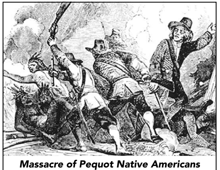
Massacre of Pequot Native Americans

Ruling-class U.S. historians developed the modern Thanksgiving myth in the 1890s to help unify workers around a common, patriotic history. However, U.S. rulers continued the policy of exterminating native peoples for their land after the War of Independence against England. George Washing-