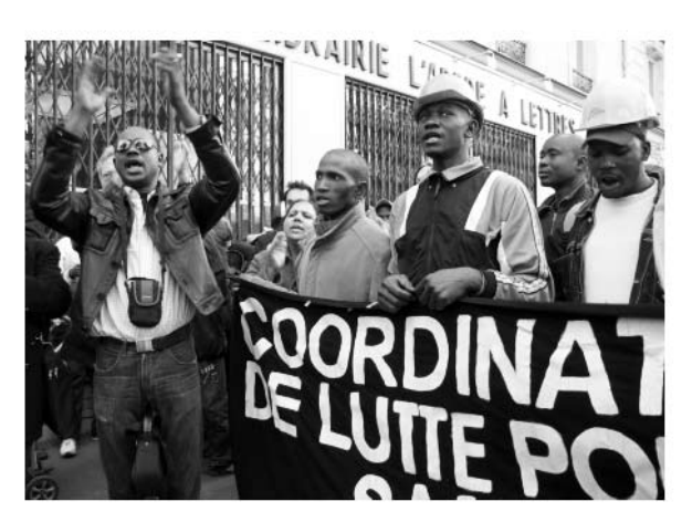
Undocumented workers at a rally.

UZES, FRANCE, Sept. 11 —The summer holiday season is over and the first strikes and demonstrations against job cuts and worsening conditions are breaking out. A case in point: high school teachers struck the whole first week of classes in this small town in Southern France (pop. 7,800, 2004 unemployment rate: 19%, average weekly household income: 275 euros), occupying the principal's office on Sept. 1. The strikers were mobilizing against obligatory overtime and over-crowded classes. The local board of education refused even to receive a parent-teacher delegation on Sept. 4.