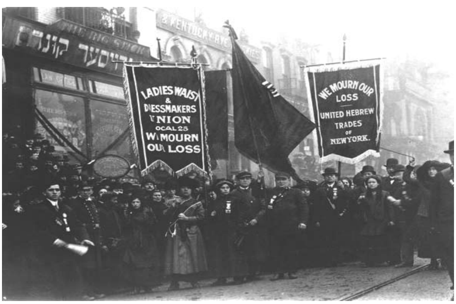
Workers march during the funeral of the victims of the Triangle Fire in New York City.

The end of the civil war has brought no social peace to workers here; violent criminal gangs are rampant (many formed in the U.S.). Conditions for workers in general are horrendous. Meanwhile the FMLN (the former guerrilla group now turned into the second largest electoral party) talks and talks, just offering a "reformed-capital-