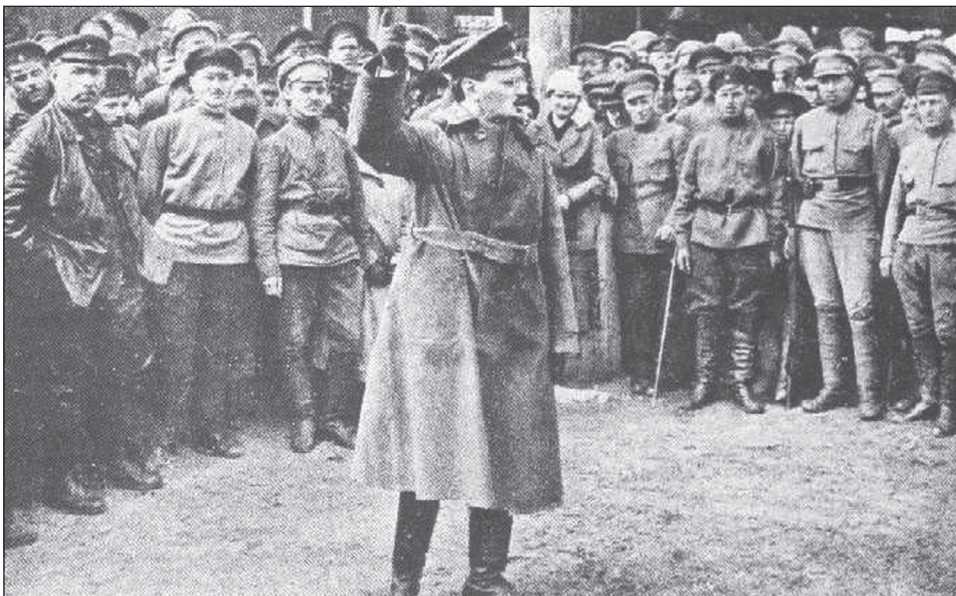
Trotsky addresses Red Army soldiers in Moscow in 1918

This attitude stems from Trotsky himself. One source was Trotsky's own egoism. Another was his removal from political struggle. Trotsky had never been a worker; had, in fact, never worked for a living. He had long been divorced from contact with the working class, shown by his proposal in the early '20s to ban unions and put workers under military discipline. His following was overwhelmingly among intellectuals. After his exile in 1929, this divorce from practice deepened.