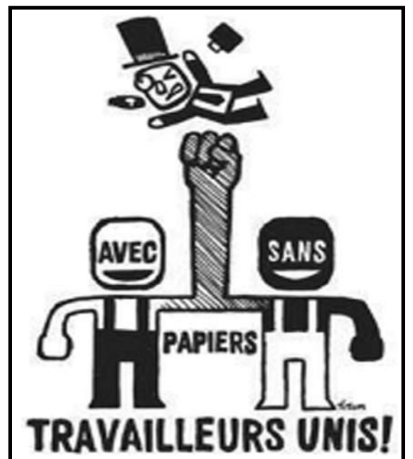
"Avec," means "with" and "sans" means "without," while "papiers" means "documents." "Travailleurs Unis!" means "Workers United!"

As we support these workers in their struggle against the French bosses' government, we should note that obtaining "legalization" is only a partial, immediate reform, hardly a band-aid on the running sore from the super-exploitation that is capitalism. From this struggle we need to draw the lessons, inspiration and energy necessary to overthrow capitalism with communist revolution. ☺