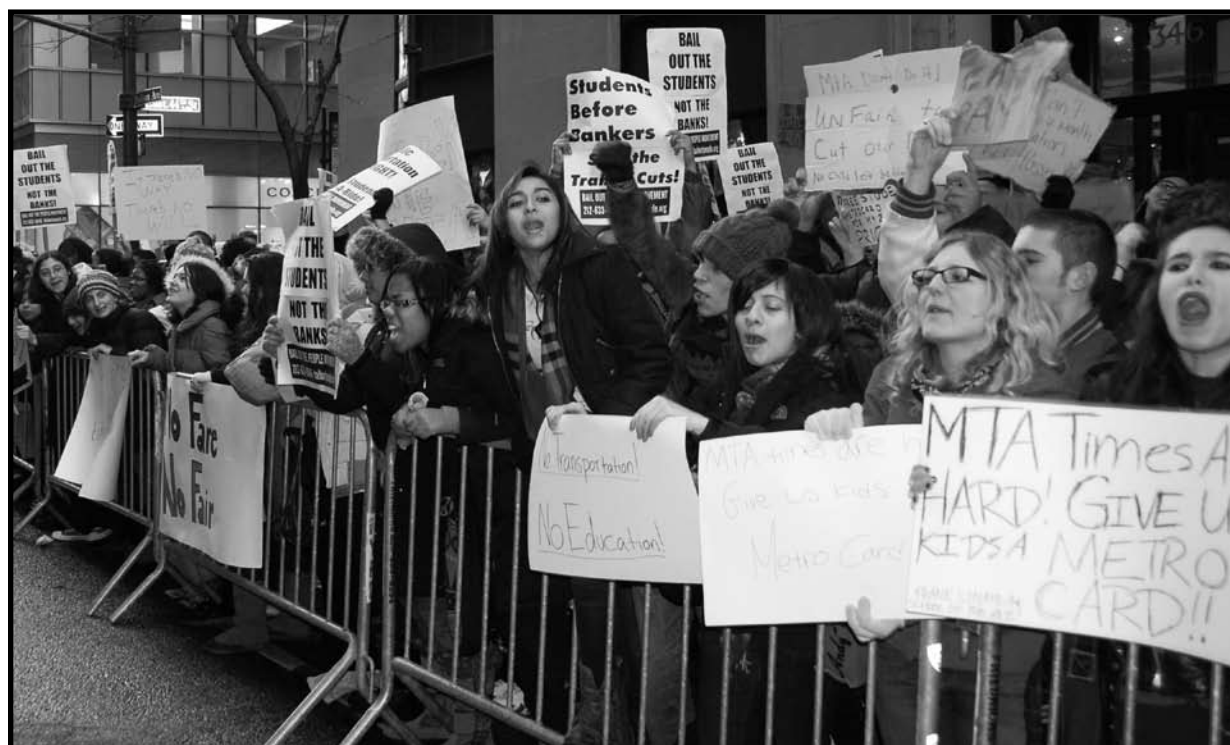
NEW YORK CITY, December 21st — Over 300 black, Latino, white and Asian high school and middle school students rallied today against the proposed MTA elimination of student free-[[transit fare cards. The students responded well to PL chants and literature. (More next issue)