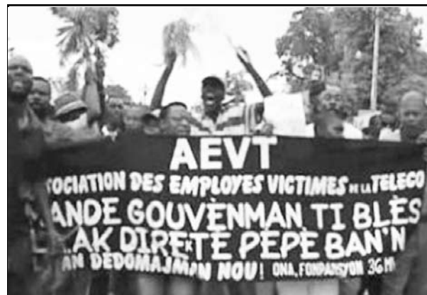
2008 — Workers in Haiti Protest Against Rising Food Prices

But while the jury may be out on Haiti's possible hydrocarbon bonanza, U.S. rulers have identified nearby enemy Venezuela as potentially another Saudi Arabia. Britain's government-controlled BBC noted (1/23), amid the U.S. build-up in Haiti, "Scientists working for the U.S. Geological Survey say Venezuela's Orinoco belt