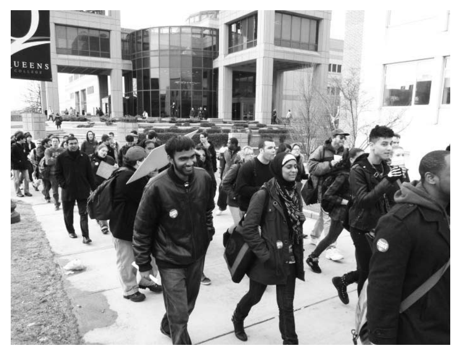
March 4th rally at Queens College

Many antiwar students and faculty engaged in discussing ways to use the theory and practice of revolutionary communist politics and build a strong movement on our campuses and beyond. PLP's politics guided the wider discussions, enabling the growing solidarity among the members and organizers to unite more than in the past, deepening the potential of a communist future. •