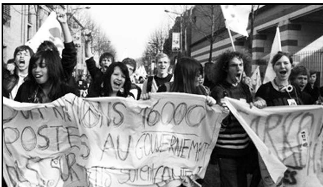
Amiens, France, March 23, 2010 — The banner reads "Eliminate 16,000 jobs in the government," (among the ministers and top politicians). This refers to the elimination of 16,000 teaching jobs this year. See more, page 5.

While capitalist bosses set up national borders and use them to divide workers and super-exploit immigrants, they have no hesitation to cross these borders themselves in their drive for maximum profits. Still another reason for workers to unite worldwide to destroy this thieving system and replace it with one run by and for the working class — communism. ✪