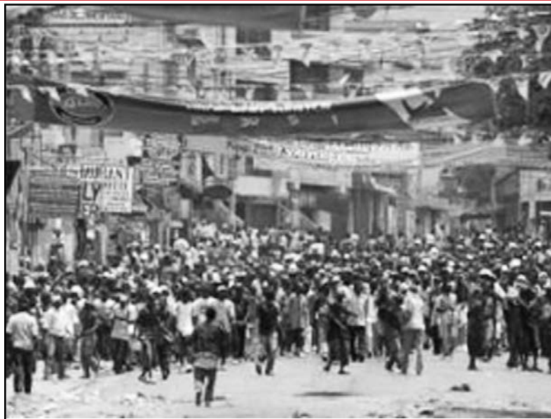
2008 protest in Haiti against rising food prices

PLP is presenting the idea that a revolutionary party is a necessity within unions and also to link the few unionized workers with the vast masses of the unemployed (70%). We speak of unions as possibly "schools of revolution," in Lenin's phrase, but only if there are communists