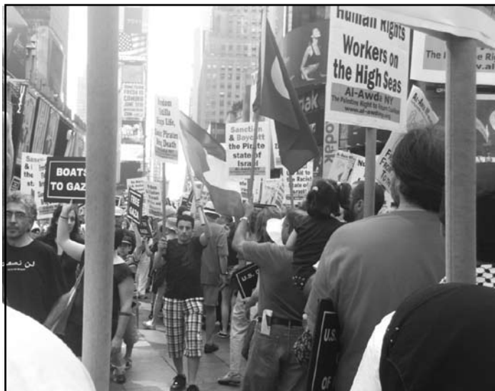
NYC march against Israeli fascist attack. See article 'Nationalist Two-State 'Solution' Won't Free Palestine's Workers,' p. 5

TEL AVIV, ISRAEL, June 2 — Following the massacre on one of the supply ships headed to Gaza earlier this month, the Israeli fascist group "Im Tirtzu" organized a rally at the entrance of the Tel Aviv University in support of that deed and of the Israeli army. The fascists were supported by the Student Council and managed to attract a large crowd of students to their rally.