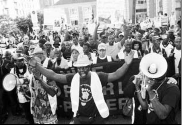
Nice, France, March 31

In France, 50% of women don't qualify for full retirement pensions, partly because they're forced to quit work due to a lack of childcare, and partly because they're forced more so than men — to work part-time and temporary jobs. Of four million part-time workers, 82% are women. And now their small retirement checks will be cut even further.