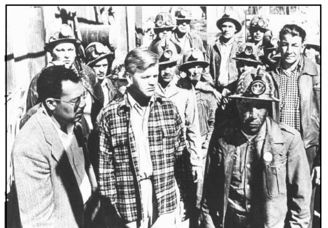
Communist-led Mine-Mill union led strike depicted in movie 'Salt of the Earth.' Women were key force for victory (photo at top).

http://readersupportednews.org/opinion/124-124/2505-race-war-in-arizona http://en.wikipedia.org/wiki/Bisbee_Deportation Francisco Arturo Rosales: "Chicano!: The History of the Mexican-American Civil Rights Movement," (pages 113-116).