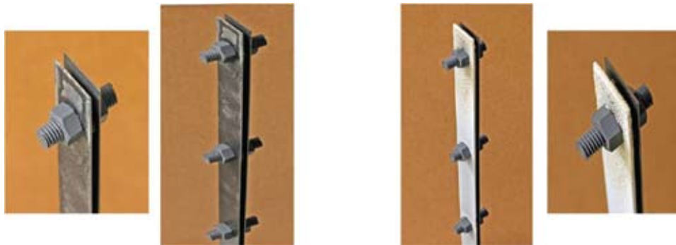
ECG Cell with Pristiva = no scale ECG Cell without Pristiva = a scaling problem

These are representative of the plates inside your chlorine generator