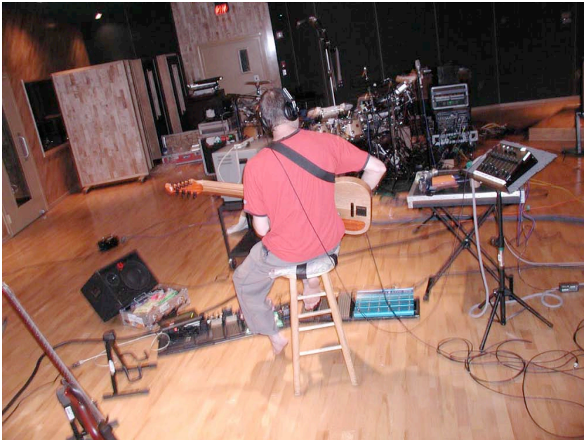
recording "The Power To Believe" with King Crimson