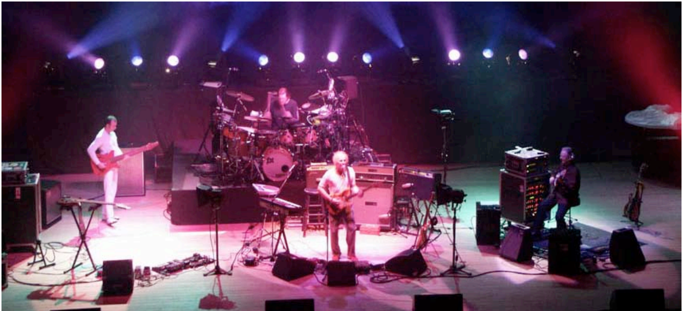
both SWR's (Henry the 8x8 – behind, Triad – on the left) at work with King Crimson – The Power To Believe tour

manual for SWR speaker cabinets: http://support.swramps.com/manuals/pdfs/procabs_om.PDF