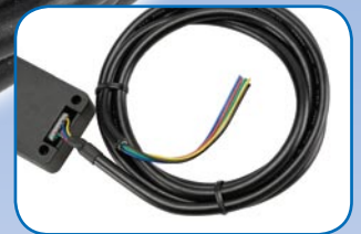
1.5m Pre-Wired Harness