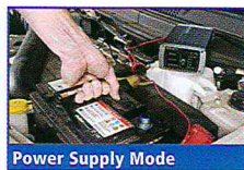
Power Supply Mode

Set the charging profile to suit battery chemistry type: Wet, Calcium, AGM or Gel