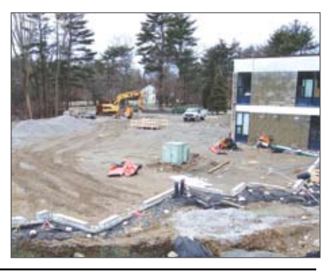
THE VINE: February 2012