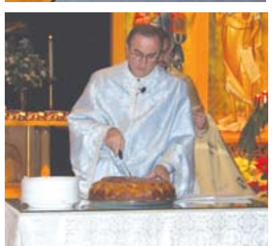
GOYA Good Morning Bethany