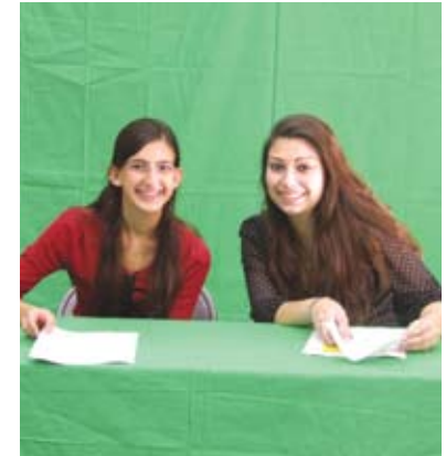
THE VINE: February 2012