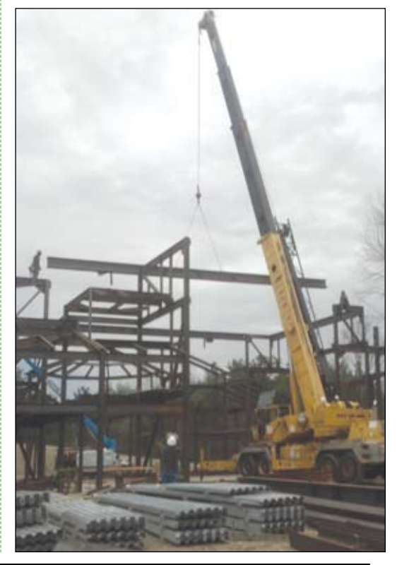
THE VINE: April 2012