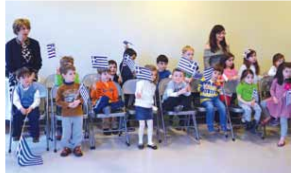
Greek Independence Day Celebration