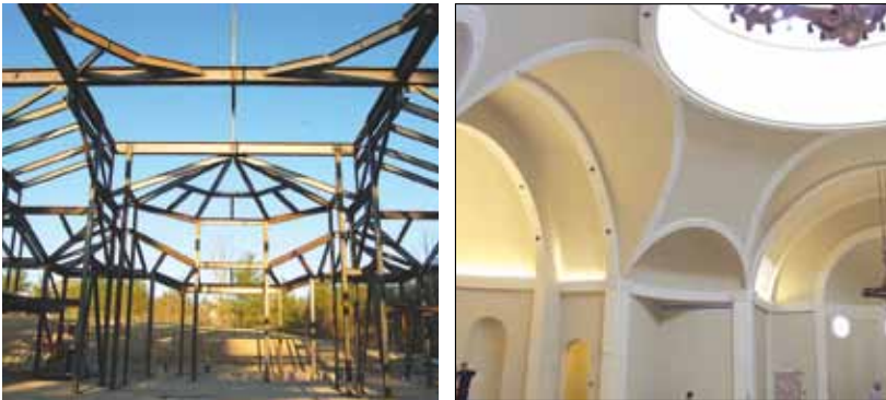
Church Building Project then and now