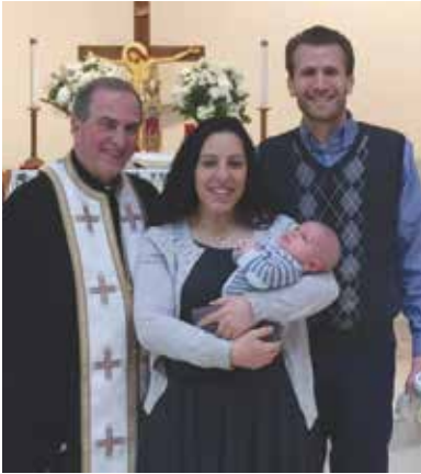
Churching of Baby Mott!