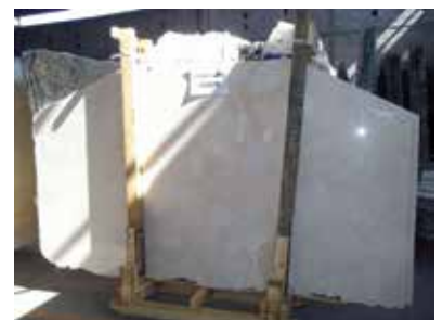
Marble that will be made into our new church fixtures