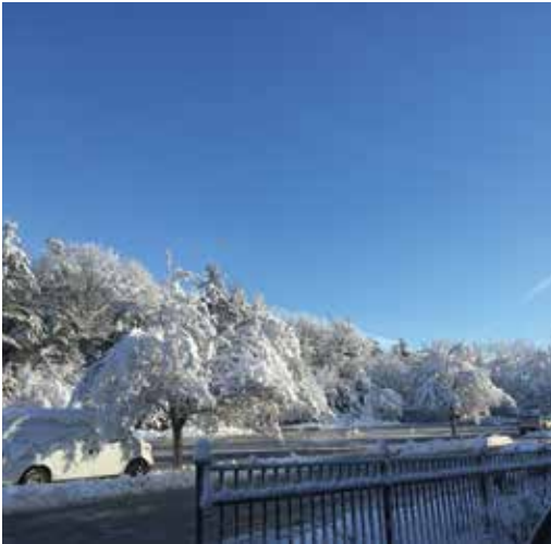
Winter at St. Demetrios