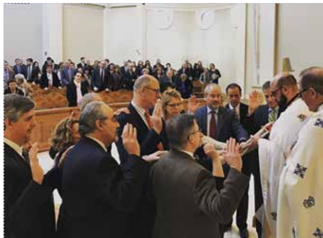
Swearing in of Parish Council