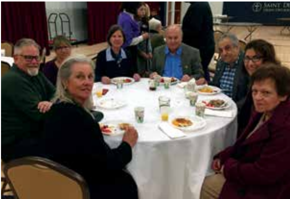
Lazarus Saturday and Palm Sunday