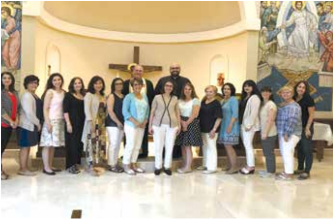
New Philoptochos Board Members