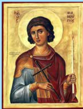
PRAYER TO ST. PHANOURIOS

On the day of the Saint, there is a tradition that the faithful bake a special bread, "Phanouropita." The name, Phanourios, comes from the Greek word, "phanerono," which means to reveal." He is known to help people find lost items. After the lost item is found, a Phanouropita is made, in honor of his mother; it is blessed and given to the poor or shared with others in thanksgiving.